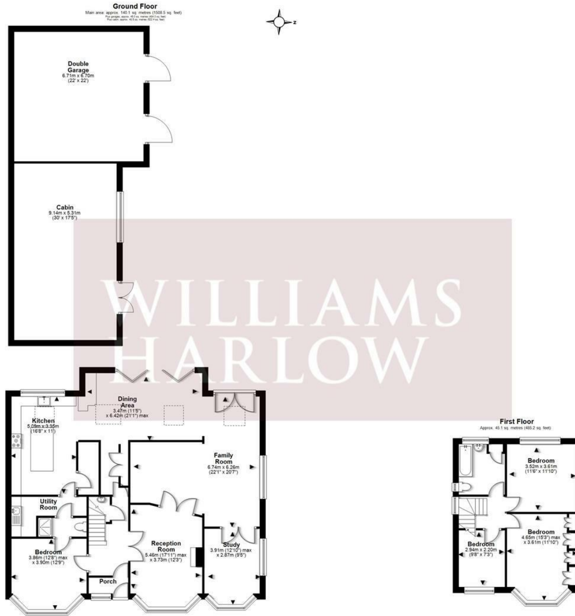
Main area: Approx. 185.2 sq. metres (1993.8 sq. feet) Plus garage: approx. 45.3 sq. metres (485.2 sq. feet) Plus cabin: approx. 48.5 sq. metres (522.4 sq. feet)

Whilst we endeavour to make our sales particulars accurate and reliable, however, they do not constitute or form part of an offer or any contract and none is to be relied upon as statements of representation or fact. The services, systems and appliances listed in this specification have not been tested by us and no guarantees as to their operating ability or efficiency are given. All measurements have been taken as guide to prospective buyers only, and are not precise. If you require clarification or further information on any points, please contact us, especially if you are travelling some distance to view.